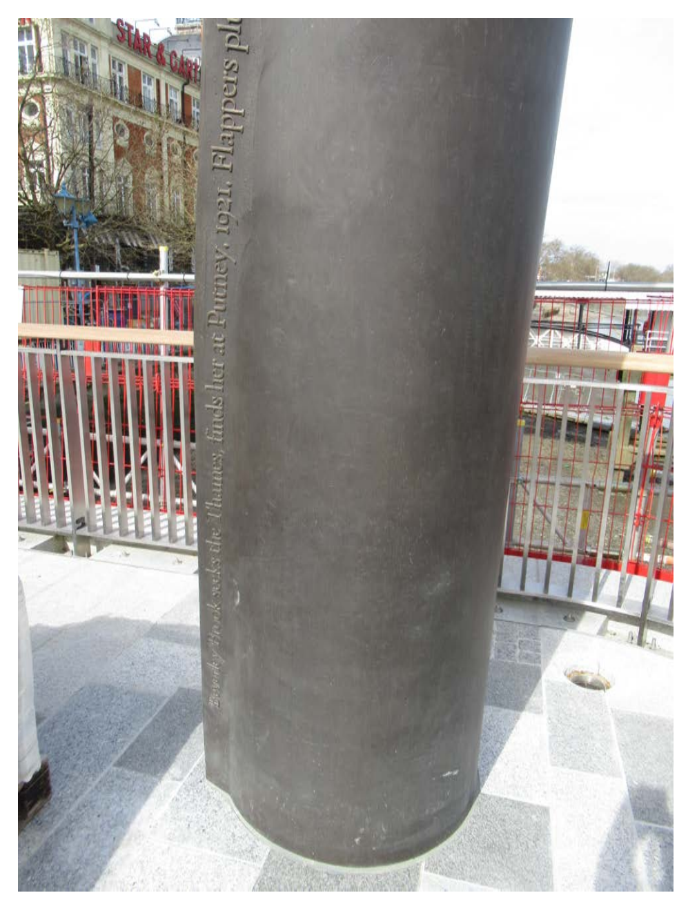
Putney Embankment (bronze)