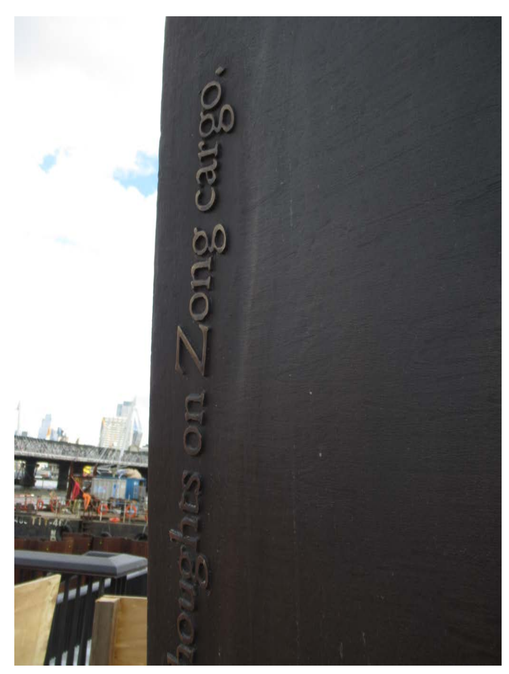
Vent 1 Victoria Embankment Foreshore (Tyburn Quay) - detail