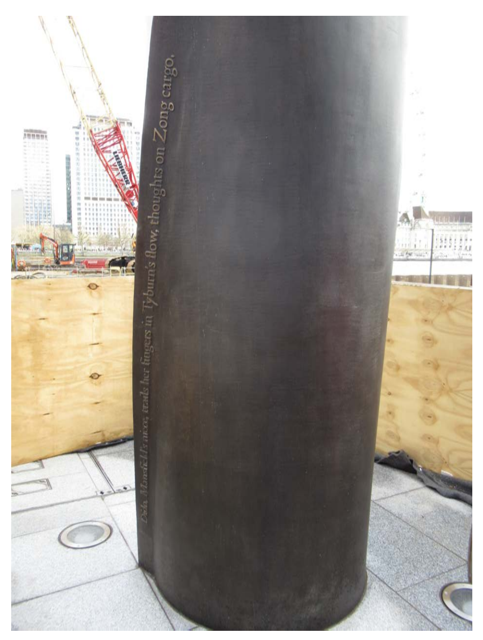
Vent 1 Victoria Embankment Foreshore (Tyburn Quay), bronze.

2.2.4 Below is an image of the bronze columns for the Tideway Victoria Embankment Foreshore site recently installed, and Putney Embankment – which show the same font and font size as proposed for Bazalgette Embankment and how these will look once installed.